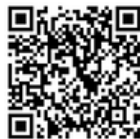
RETAILER PARKING PERMIT ^SCAN HERE^